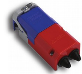
Low Force Lever Release model

An armour bond kit is available, comprising: - clamp, ferrules, lead-strips and fixing screws. Suitable for loop in/out cables.